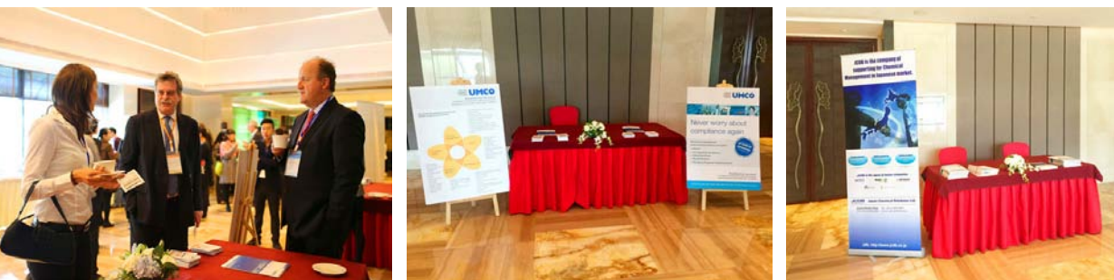
CRAC 2015 Exhibition Stand

As significant cooperative partners of the 8th Chemical Regulatory Annual Conference (CRAC 2016), REACH24H Consulting Group together with ChemLinked is committed to providing the best support to promote your publicity. With over 200 chemical professionals from over 150 companies, the CRAC 2016 offers branding, networking and three levels of sponsorship opportunities for promoting your company. All sponsors will be recognized in printed conference materials and electronic media both in Chinese and English.